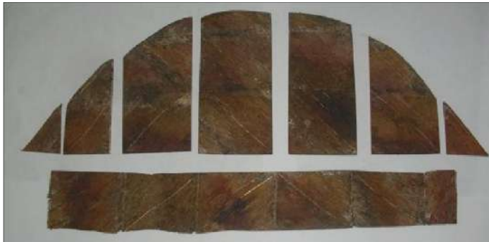
Figure 7. Filigree plate pierced into segments.