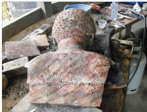
Figure 8. Completion of the filigree bust's back.

the metal surfaces to be soldered need be prepared so that the mating of the various parts will be perfectly done. As it has already been alluded to by the researchers, the fabrication of the filigree bust was constructed in parts before assembling them together. The work has three major components (head, Neck and the body/costume) with each having a number of units that constitute these major components of the filigree bust. For example, the head made up of the face under which forehead, eyes, nose, lips, cheeks, ears, chin, eyes and hair were made. There were also jumper and the cloth that composed the dress of the filigree bust. The embossed sections from the pierced filigree plates were soldered sequentially (Figure, 8, 9A-C, and 10A-D) in a well-ordered manner to build the life size photorealistic filigree bust of the first president of the Republic of Ghana in the person of Osagyefo Kwame Nkrumah.