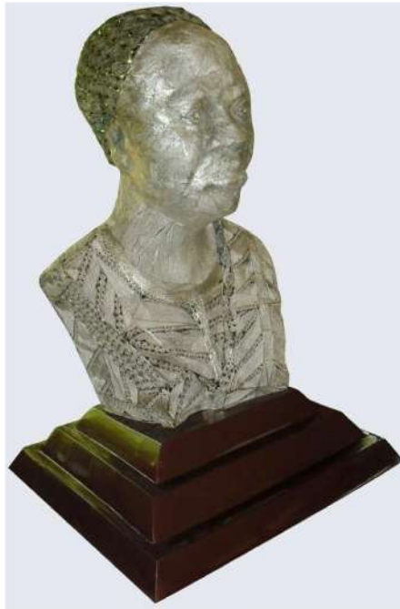
Figure 11. The complete fabricated filigree bust (Studio work).

This study aims to determine as to the limitations in producing artefacts other than jewellery-scaled design using filigree technique could be overcome, regardless of the design or size, through the application of filigree technique in jewellery making to design and produce a life size photorealistic bust of Osagyefo Kwame Nkrumah, the first president of Ghana. The outcome of the study indicates that it is possible to create any sculptural object using a filigree technique, regardless of design and type, through the use of the required material and workshop processes, as shown in the final work piece in Figure 11. The finding echoes what Artstudio64 (2019:2) said: “different small parts are created, then soldered together to build up a wearable sculpture”. The literature records a close collaboration between filigree development and Greek and Etruscan cultures. Both cultures played a pioneering role in creating wire works in the past with them being said to be the first people to manufacture filigree jewellery. Furthermore, the literature review found no apparent correlation between filigree and the sculpture of bust. Unlike the researchers’ fears, this study found no substantial difference between the methods of