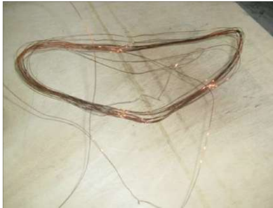
Figure 3. The raw material (copper wire) that was used for the work.

nylon hammer, tweezers, soldering table, metal ruler, dead blow, stakes and anvil. Electronic digital callipers, files (both smooth and rough), adjustable saw frame and blades were also used. Others are dividers, digital shears, scale and soldering kits and a cement model of the subject.