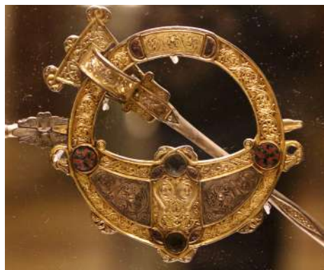
Figure 2. (a) the Ardagh Chalice, (b) Tora brooch (Britanica, 2023; Stevick, 1998).