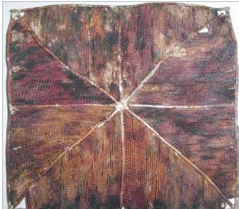
Figure 6. Linear filling that has been soldered.

Soldering is a process in jewellery making whereby filler metal which is known as solder is melted for the purpose of bonding two or more metal pieces together. Usually, the filler metal has a lower melting point compared to the melting temperature of the base metal. As it has been indicated, the researchers used an open-work filigree type of the work. This made it wire-to-wire work without any support which posed a peculiar soldering challenge. To overcome this, a high refractory and heat-retention charcoal block was used as a temporary support of the work (Figure 6). This facilitated the soldering of the frame with the fitted filigree wire.