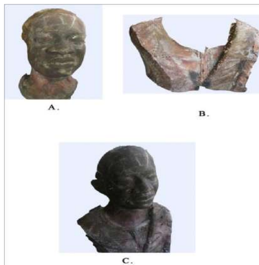
Figure 9 (A-C). Assembled front portion of the filigree bust Author's Construct (Studio work).