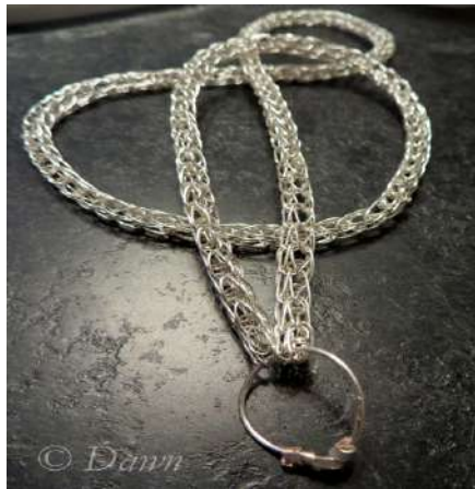
Figure 1. A Trichinopily chain (Dawn 2015).

can create similar-looking effects. Cultures like the Indians and Egyptians had their own wire works too, such as the Trichinopily chain (Figure 1).