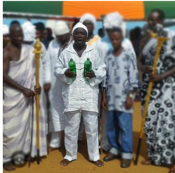
(c and d) Ewe traditional leaders performing libation with calabash and barefooted