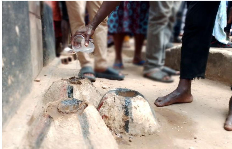
d. Figure 4: Various traditional leaders performing a libationary prayer; all using the right hand

In most African cultures, with Ghana inclusive, there is a left-hand taboo which prohibits the use of the left hand in interacting with people (Wójtowicz, 2021). However, the left hand can be swiftly used to pour the offering when pronouncing curses. This is a way of averting calamities and to condemn negativity during libations (Asare-Tettey, 2016), as demonstrated in Figure 5 (a and b).