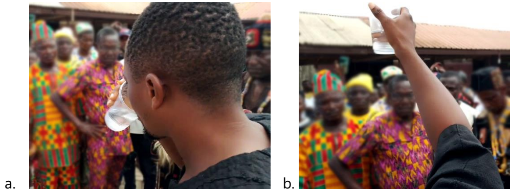
Figure 3 (a and b): An Asafohen performing the initial stages of libation

Per the traditional ethics and protocols of most African cultures, handshake, giving and receiving an item and other social activities are expected to be done with the right hand (Wójtowicz, 2021). Similarly, among the Akan, Ewe and the Kasena Nankana of Ghana, the right hand is predominantly used during libation (Asare-Tettey, 2016). However, in cases where the right hand is preoccupied, a plea must accompany the use of the left hand in such situations (Agyekum, 2008). This is evident in Figure 4 (a-c).